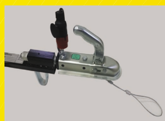
• Swivel Hitch Upgrade for Motorcycles (600LX only)