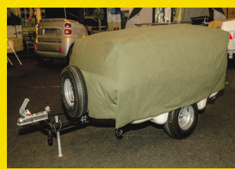
• Heavy Duty Canvas Storage Cover