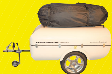
• Luggage Rack Carry Bag