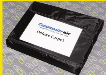
• Carpet with Bag