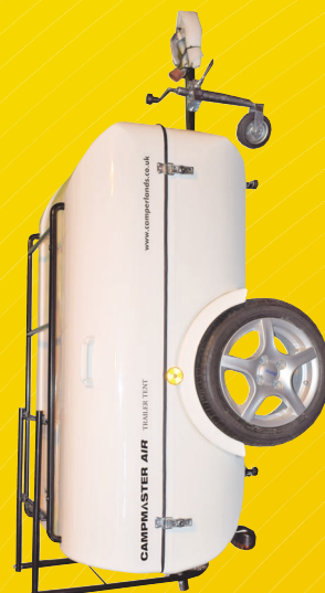
• End Storage Bracket