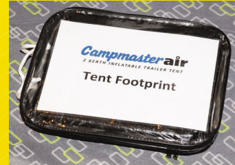
• Footprint with Bag