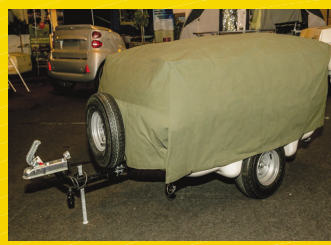
• Heavy Duty Canvas Storage Cover