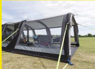
• Front Canopy (Either vestibule fits this canopy)