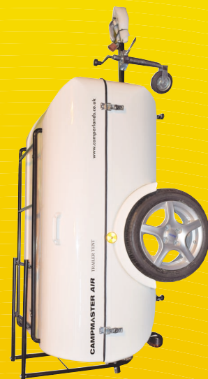
• End Storage Bracket