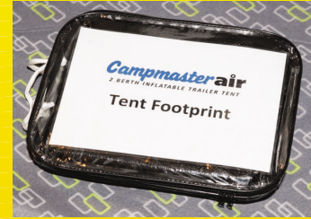
• Footprint with Bag