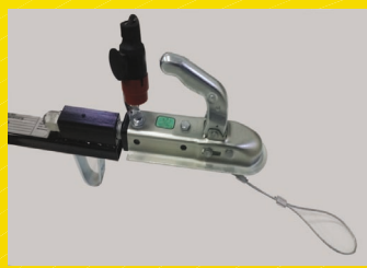
• Swivel Hitch Upgrade for Motorcycles (600LX only)