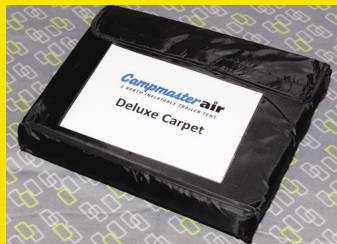
• Carpet with Bag