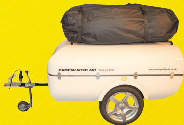
• Luggage Rack Carry Bag