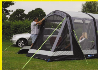
• Polycotton or Mesh Vestibule (Mesh Shown)