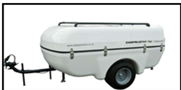
ULTRALIGHT FIBREGLASS BODY