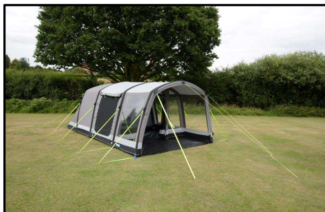
AIRBEAM TRAILER TENT NEW COLOURS FOR 2018