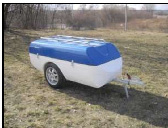
NEW FOR 2018 CAMPMASTER 1000L TRAILER