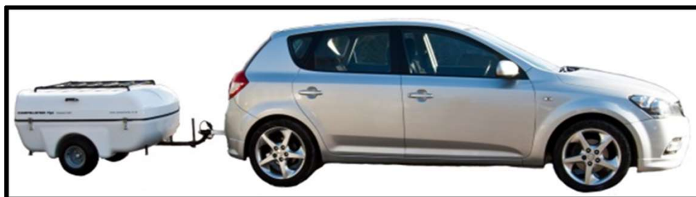
MODERN LOW PROFILE LIGHTWEIGHT TRAILER FOR TOWING