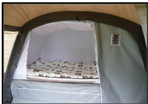
ENCLOSED LARGE DOUBLE BED WITH FOAM MATTRESS