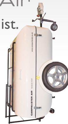
END STORAGE BRACKETS