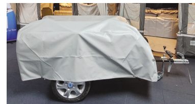
HEAVY DUTY STORAGE COVER