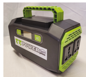
POWER PLUS POWER STATIONS