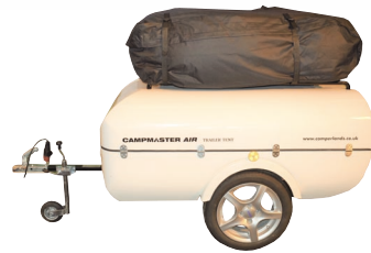
LUGGAGE RACK CARRY BAG