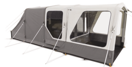
EXTENSION CANOPY 600LX (230x180cm) 1000LX (300x190cm)

OPTIONS - See price list for complete accessory list.