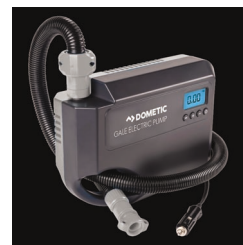
12v AIR PUMP