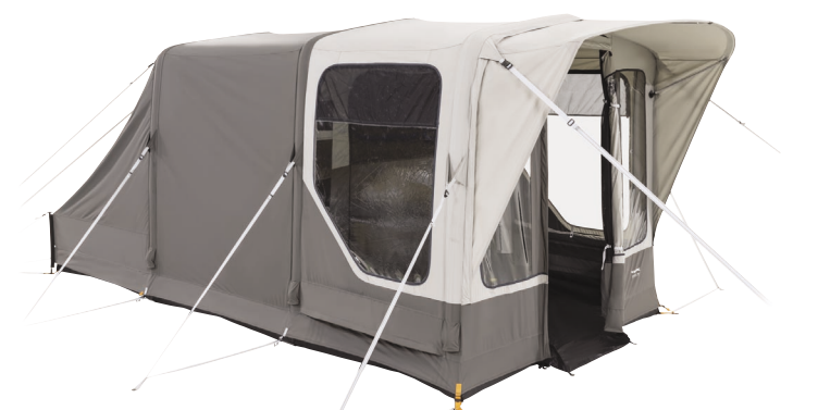
Campmaster Air 600LX