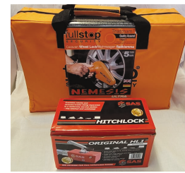
HITCH LOCK & WHEEL CLAMP