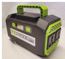
POWER PLUS POWER STATIONS