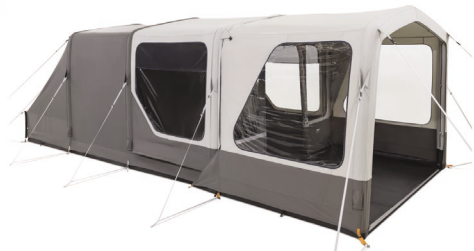
1000LX EXTENSION CANOPY (300x190cm)

OPTIONS - See price list for complete accessory list.