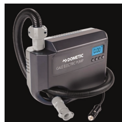
12 AIR PUMP