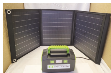
POWER PLUS SOLAR PANELS