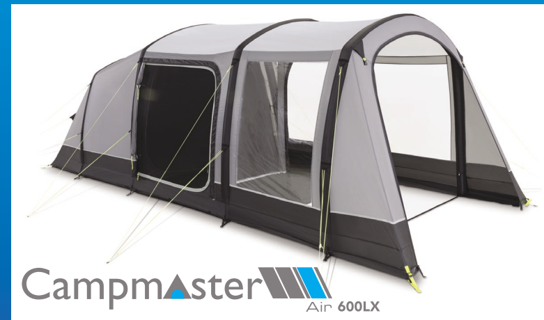
Campmaster Air 600LX