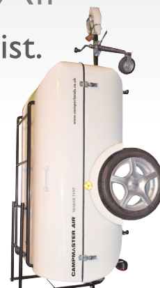
END STORAGE BRACKETS