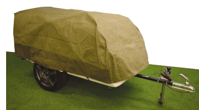
HEAVY DUTY STORAGE COVER