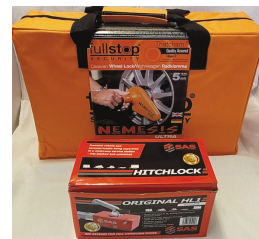
HITCH LOCK & WHEEL CLAMP