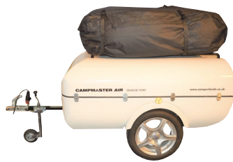
LUGGAGE RACK CARRY BAG