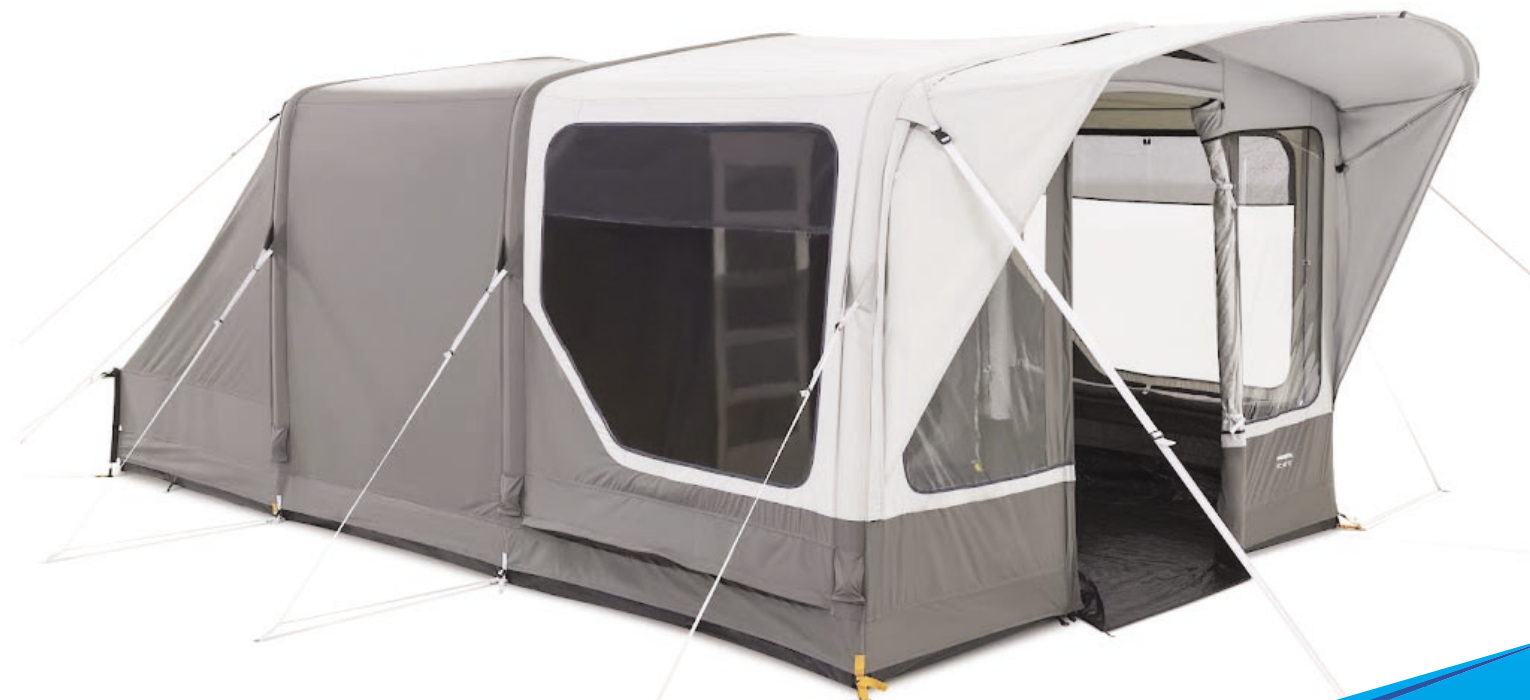
Campmaster Air 1000LX