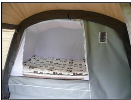
ENCLOSED LARGE DOUBLE BED WITH FOAM MATTRESS