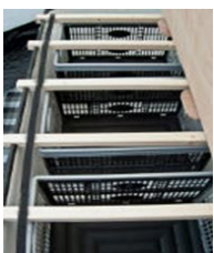
BOXES ARE FOR ILLUSTRATION ONLY

Once erected the lid of the trailer becomes an easy to access and ample storage space for clothes, equipment and any camping essentials required for your trip. The optional skirt gives plenty of handy pockets for storage as well as finishing the trailer body off.