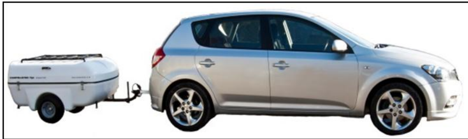
MODERN LOW PROFILE LIGHTWEIGHT TRAILER FOR TOWING