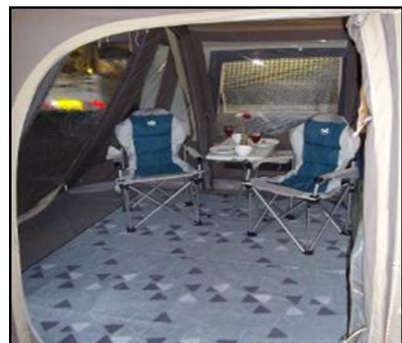
LARGE SPACIOUS LIVING AREA