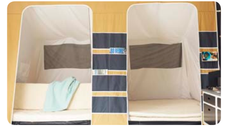
Pocket flap | Keep things organised during your holiday – standard in C/S/A/P.