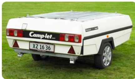
Luggage cover | Protect the Camp-let from scratches during transportation.