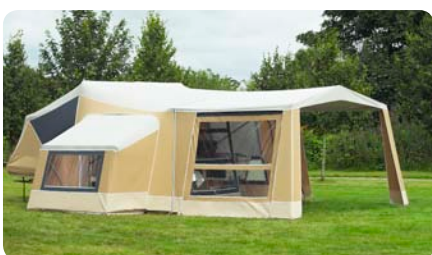
Sun canopy and side screen canopy A/P | A covered "patio" extends the long summer evenings, and the door canopy provides shelter from the wind.