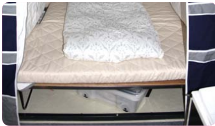
Raised bed | Provides comfort and with gas assisted lift system storage under the bed.