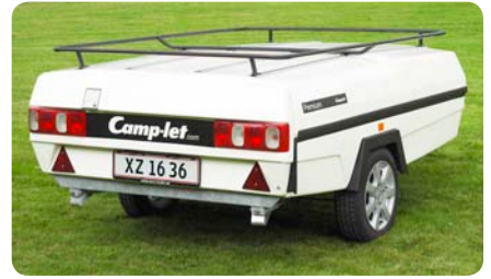
Roof rack | An easy way to take extra items with you on holiday.