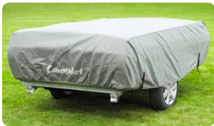
Winter cover | Protect your Camp-let from dust and dirt while in storage for the winter.