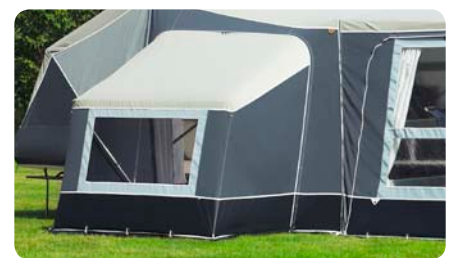
Guest annex C/S/A/P | The window zips off easily to allow the compartment to be zipped on.