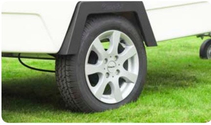
Sports alloy wheels | A smart, sporty look to complement the aerodynamic design.