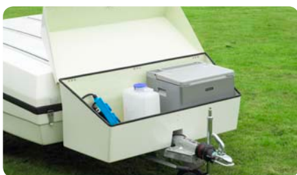
Luggage locker | Make space for a cooler, gas canister or other luggage.