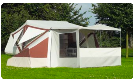
Sun canopy and side and front screen B/C/S | The side and front screen can be reversed as required.