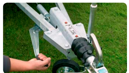
Road and hand brake | Ensures comfortable driving in hilly terrain even with a small car.