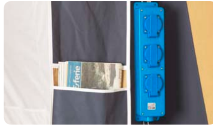
Cable kit | Power sockets in the camper, conveniently pole-mounted. 3 power outlets, 25 m strong rubber cable.