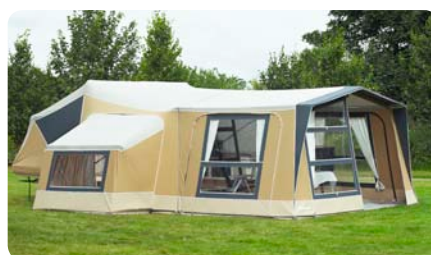
Awning A/P | Offers 10 m 2 of additional space and can be further expanded to include a guest compartment or sun canopy.

The long list of extras enables you to personalise your Camp-let.