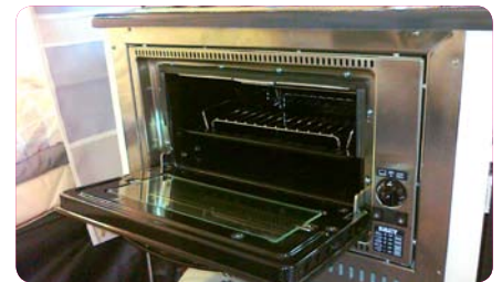
Built-in oven A/P | With the gas oven, you can have warm breakfast rolls in the morning.