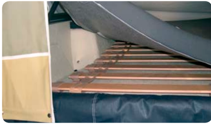
Slatted base | For additional comfort and ventilation beneath the mattresses.