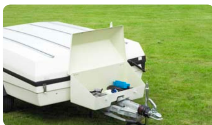
Gas and water box | Make space for pegs, cables and other equipment.