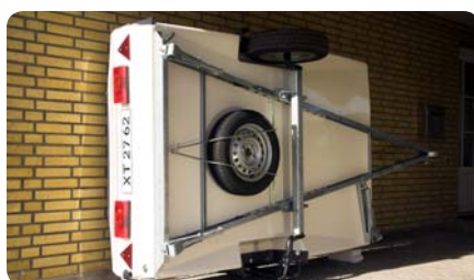
Storage bracket on wheels | Store your camper upright to save space.