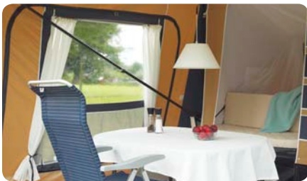
Lamp shade and tablecloth | Elegant design and matching colours for a homely feel.