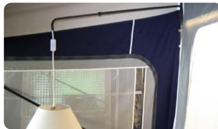
Lamp holder | Hanging the lamp is simple, and adjust using the telescopic bracket.