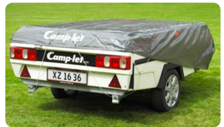
Tarpaulin | Protects the trailer from dirt and dust, and the expansion zip offers additional luggage space.