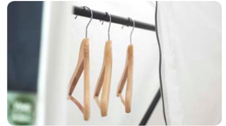
Wardrobe rail | Practical clothes hanging between the sleeping compartments – standard in C/S/A/P.