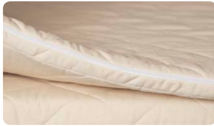
Mattress topper | This luxurious mattress topper offers additional comfort – standard in A/P.