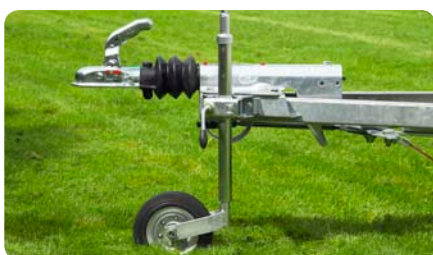
Jockey wheel | For easy handling, and to enable easy manoeuvring of the Camp-let into tight spaces.