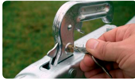
Ball hitch lock | Secure your Camp-let against theft. Easy-to-mount coupling lock.