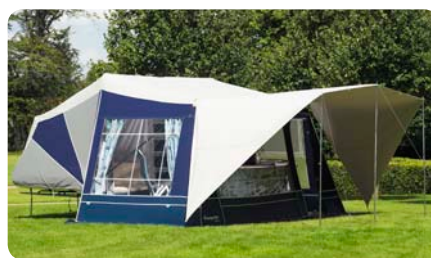
Nature sun canopy B/C/S | Provides shelter and shade.