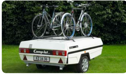
Bicycle rack | Taking your bicycles on holiday is easy – available for 2 or 4 bicycles.