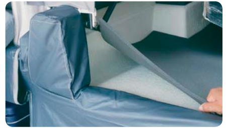
Insulation mats | Extend the season with extra insulation beneath the mattresses.