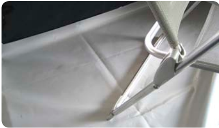
Bucket Groundsheet | The base can be zipped on quickly and stops muck and dirt.