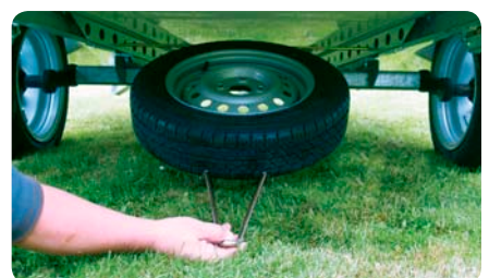
Spare wheel and carrier | Practical under-trailer mounting.