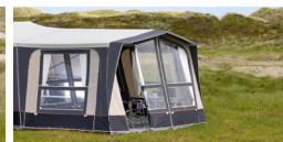
Large awning option