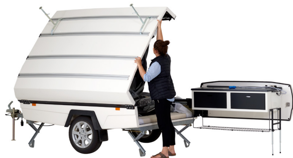
2 The trailer opens up. A practical spring system helps you open and close the trailer.