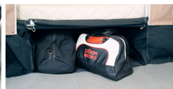
Optimal storage areas