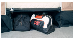
Optimal storage areas