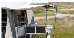
Outdoor kitchen solution