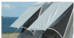
Ventilation in the sleeping compartments and kitchen