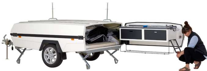
1 The built in kitchen swings out - all kitchen models can be used en-route.

Three simple steps and a matter of minutes – and you're ready to enjoy your holiday. A built in spring system means one person can open a Camp-let with no need for additional assistance.