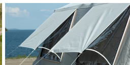
Ventilation in the sleeping compartments and kitchen