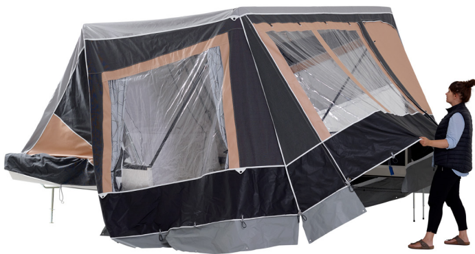
3 The large awning and sleeping compartments open in a single movement.