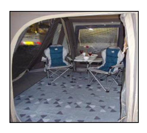
LARGE SPACIOUS LIVING AREA