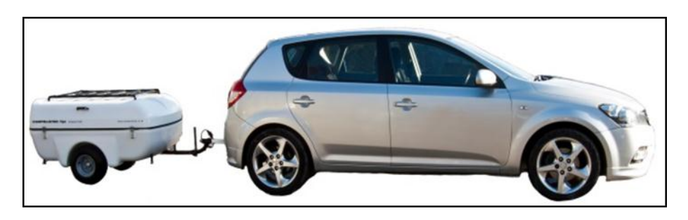
MODERN LOW PROFILE LIGHTWEIGHT TRAILER FOR TOWING