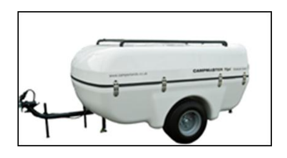
ULTRALIGHT FIBREGLASS BODY