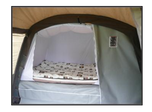
ENCLOSED LARGE DOUBLE BED WITH FOAM MATTRESS