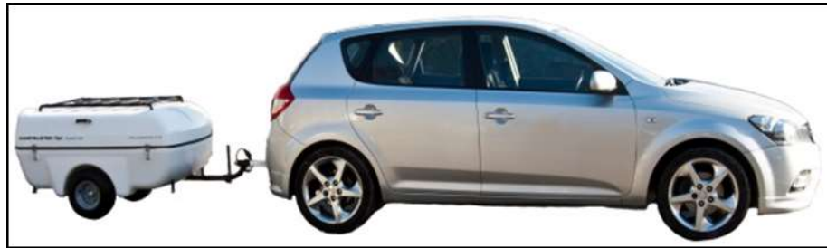
MODERN LOW PROFILE LIGHTWEIGHT TRAILER FOR TOWING