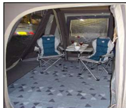
LARGE SPACIOUS LIVING AREA