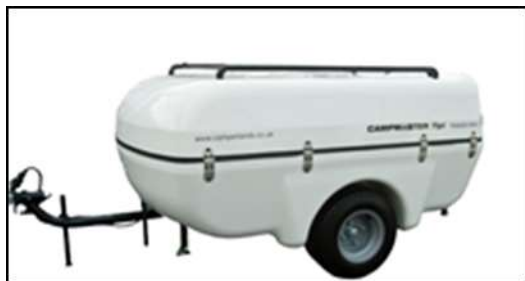
ULTRALIGHT FIBREGLASS BODY