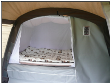
ENCLOSED LARGE DOUBLE BED WITH FOAM MATTRESS